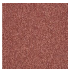
Schoolgirl 71615 LRV 7.6