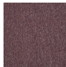
Rose Trellis 71830