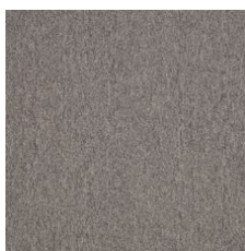
Pure Titanium 71595 LRV 10.2