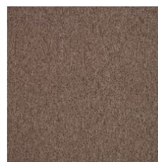
Coffee Break 71761