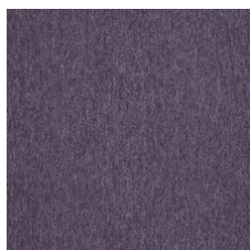
Plum Martini 71965